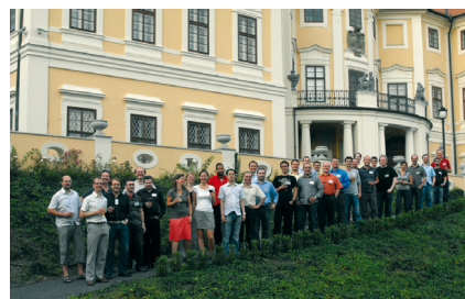
Young professors of organic chemistry from all over Europe met in Liblice Castle near Prague.