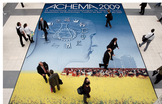
Achema 2009 attracted more than 173 000 visitors.

The exhibitors praised the high standard of discussions and contacts. This year's over-